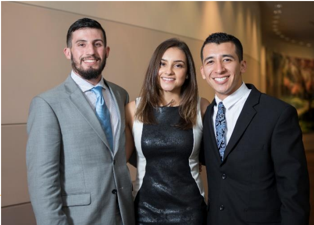
The Boxing Movement