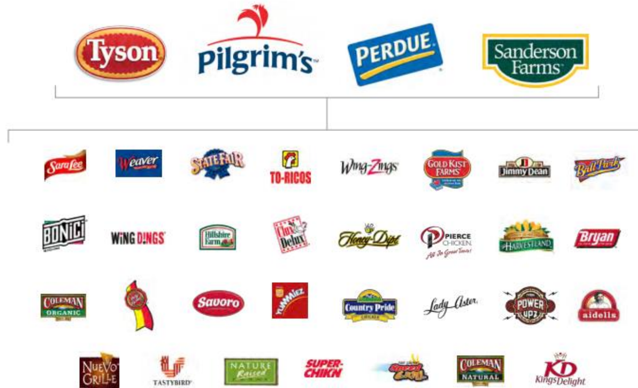
FIGURE 4. FOUR COMPANIES, DOZENS OF BRANDS, HUNDREDS OF PRODUCTS

The top four companies produce hundreds of different chicken items and market them under many brand names.