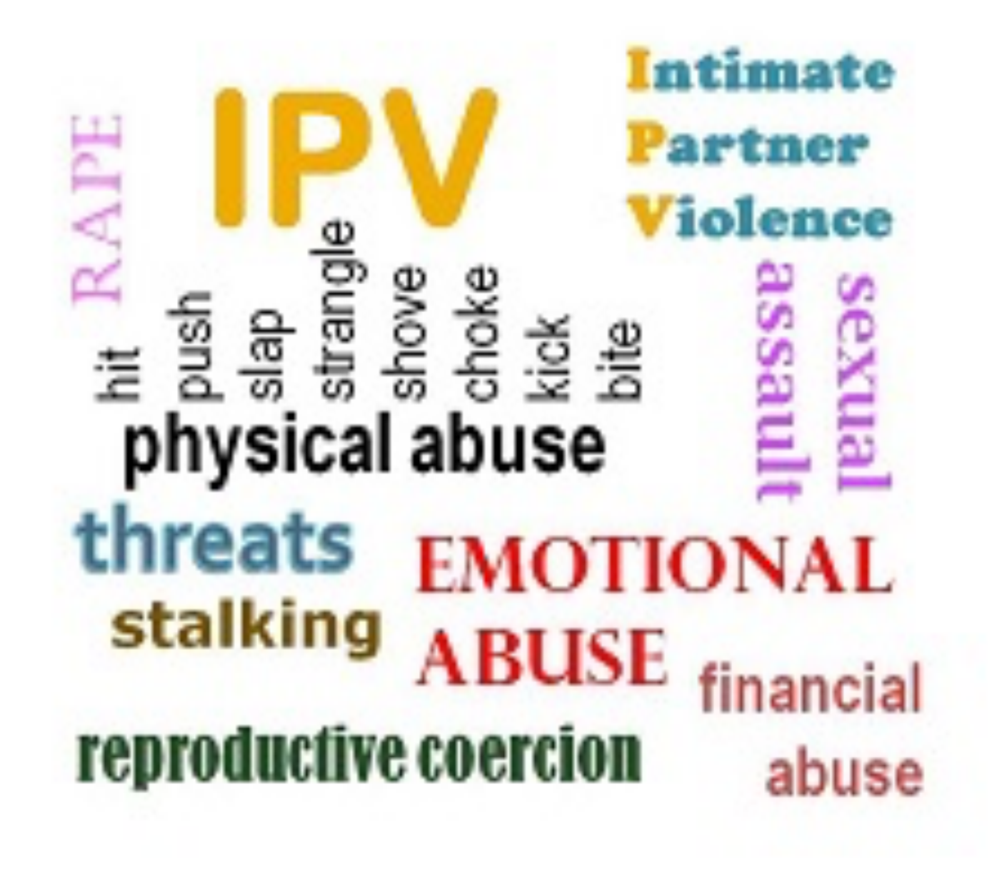
Figure 1. IPV Visual

Given the prevalence of children living in this situation, there needs to be more attention given to it and more effort to assess its effect on children's mental health and development. It is important to understand all of the factors that come into play in this interaction including attachment to parents, potential risk factors and protective factors. This is vital when creating effective plans to care for these children and to understand it's role in how children interact with others and the world.