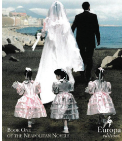
Elena Ferrante L'amie prodigieuse