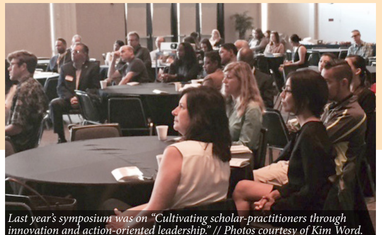
Last year's symposium was on "Cultivating scholar-practitioners through innovation and action-oriented leadership."