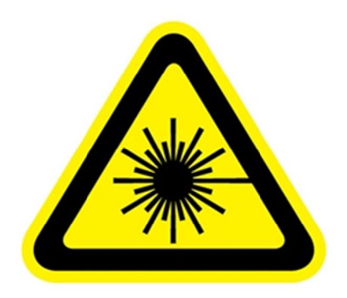
Laser Safety Program