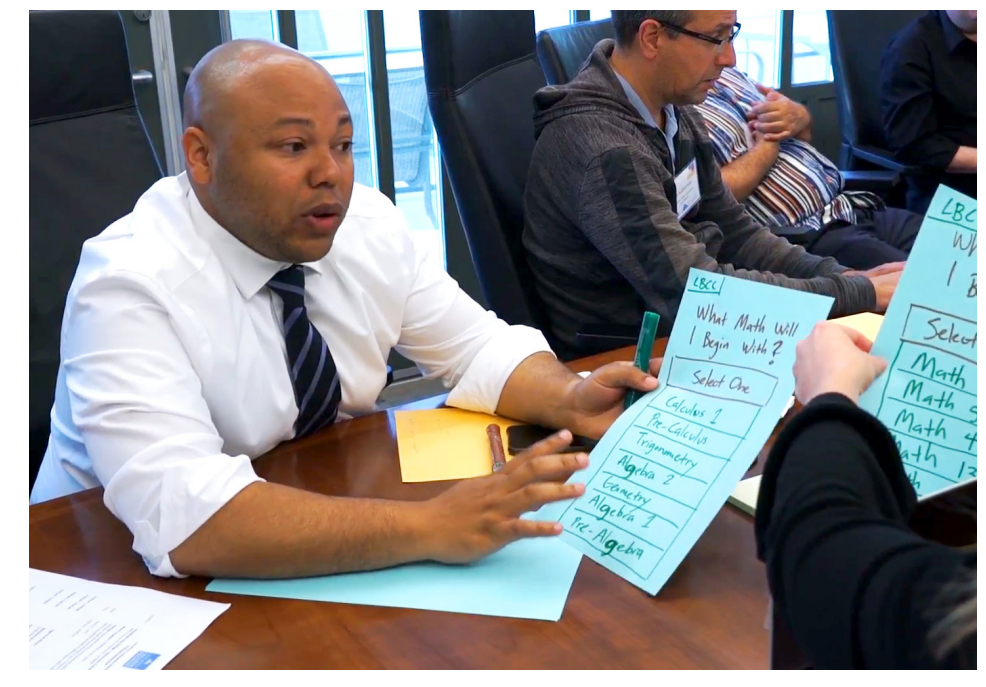
Right Leaders meet to discuss new plans for an Educational degree pathway.