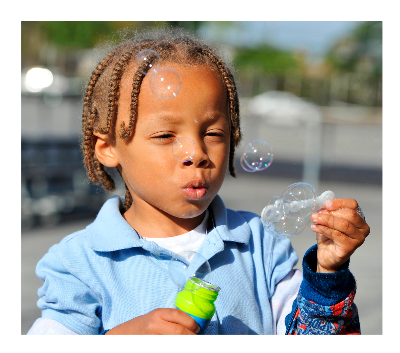
A preschooler takes a break from learning at a Child Development Center at Tincher Elementary.