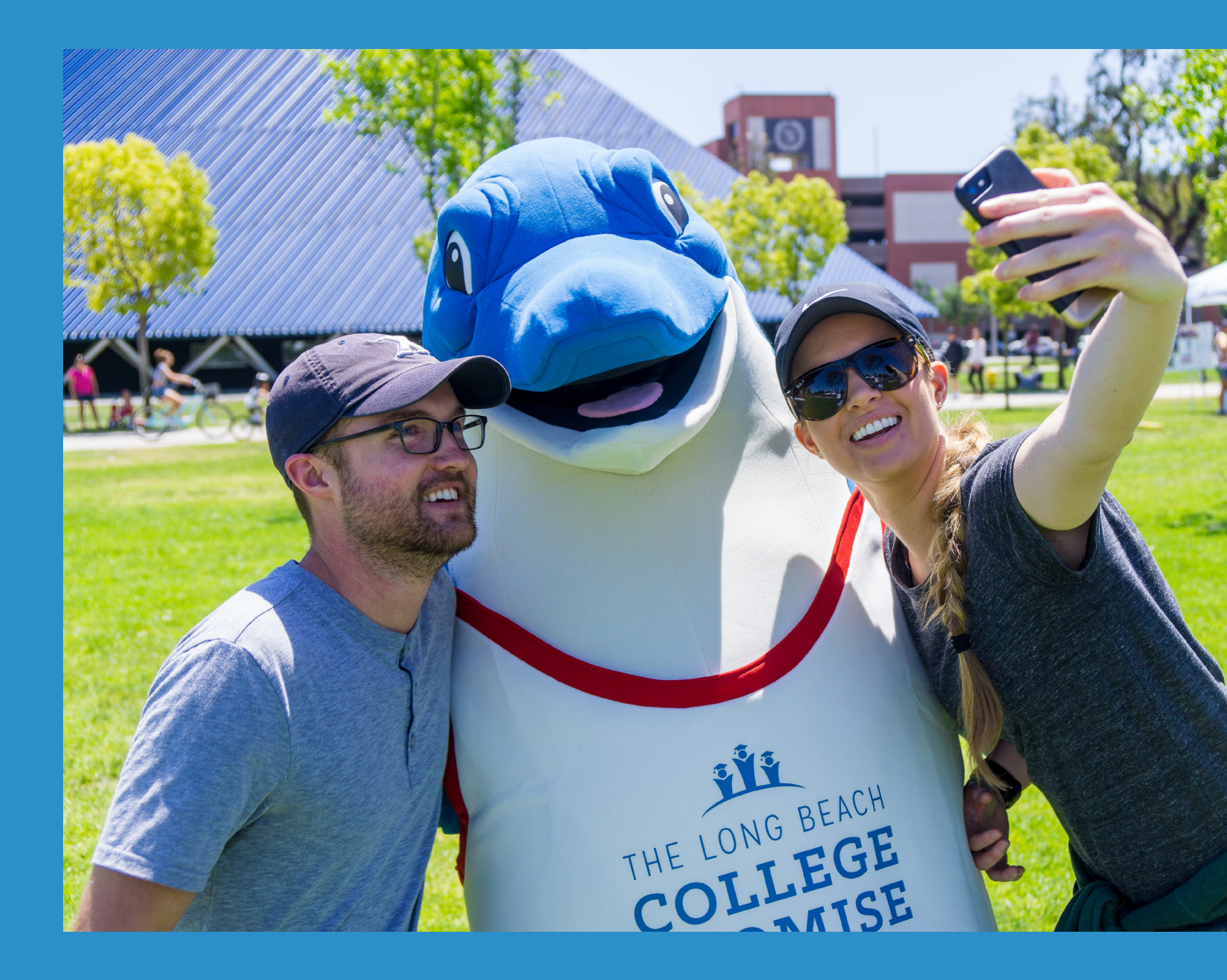
A young couple takes a selfie with Flippa the dolphin at Beach Street: