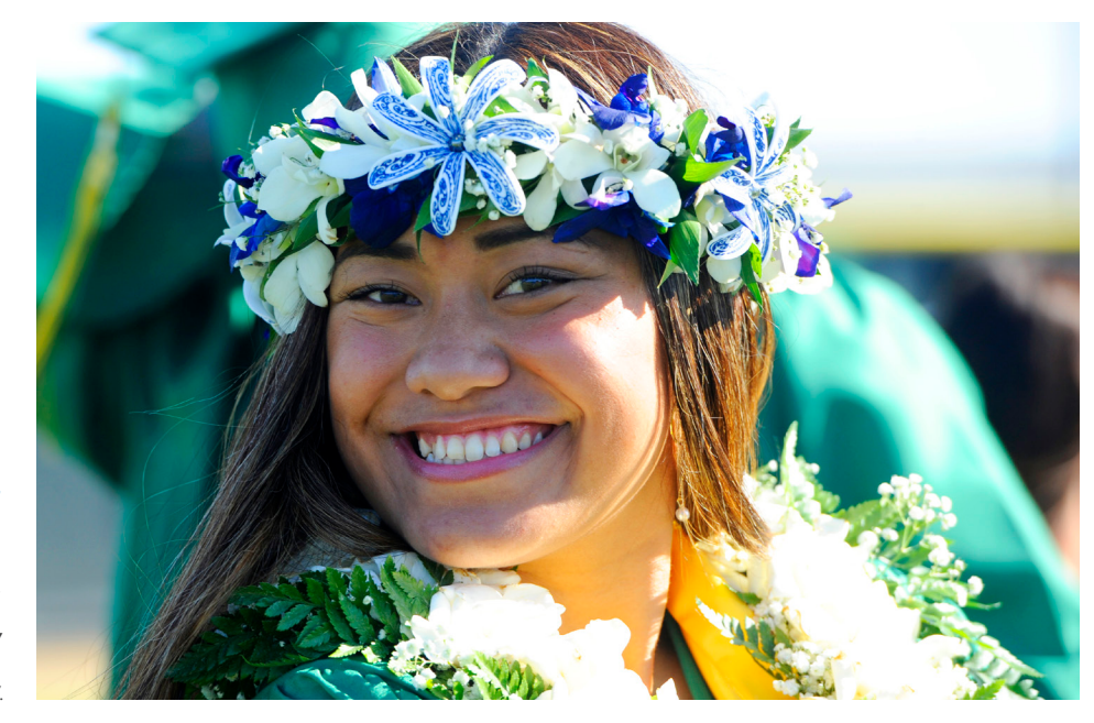
Right A student at Long Beach Polytechnic High at her 2017 graduation ceremony.