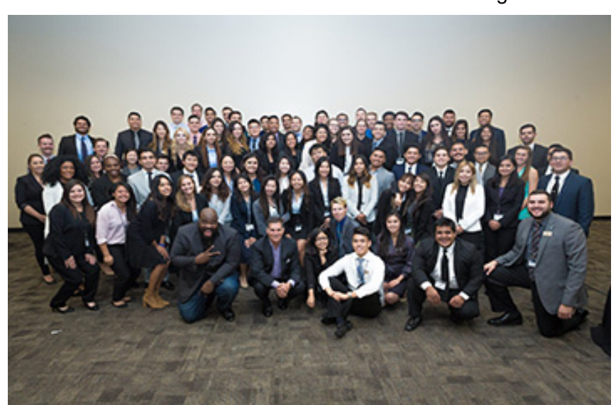
AMA students participate in the Annual AMA Western Regional Conference

This past semester AMA hosted 8 speaker events, 3 workshops, 4 marketing agency firm tours, and 2 alumni panels for members to learn more about getting jobs after college as well as what skills are essential for the most sought after marketing jobs.