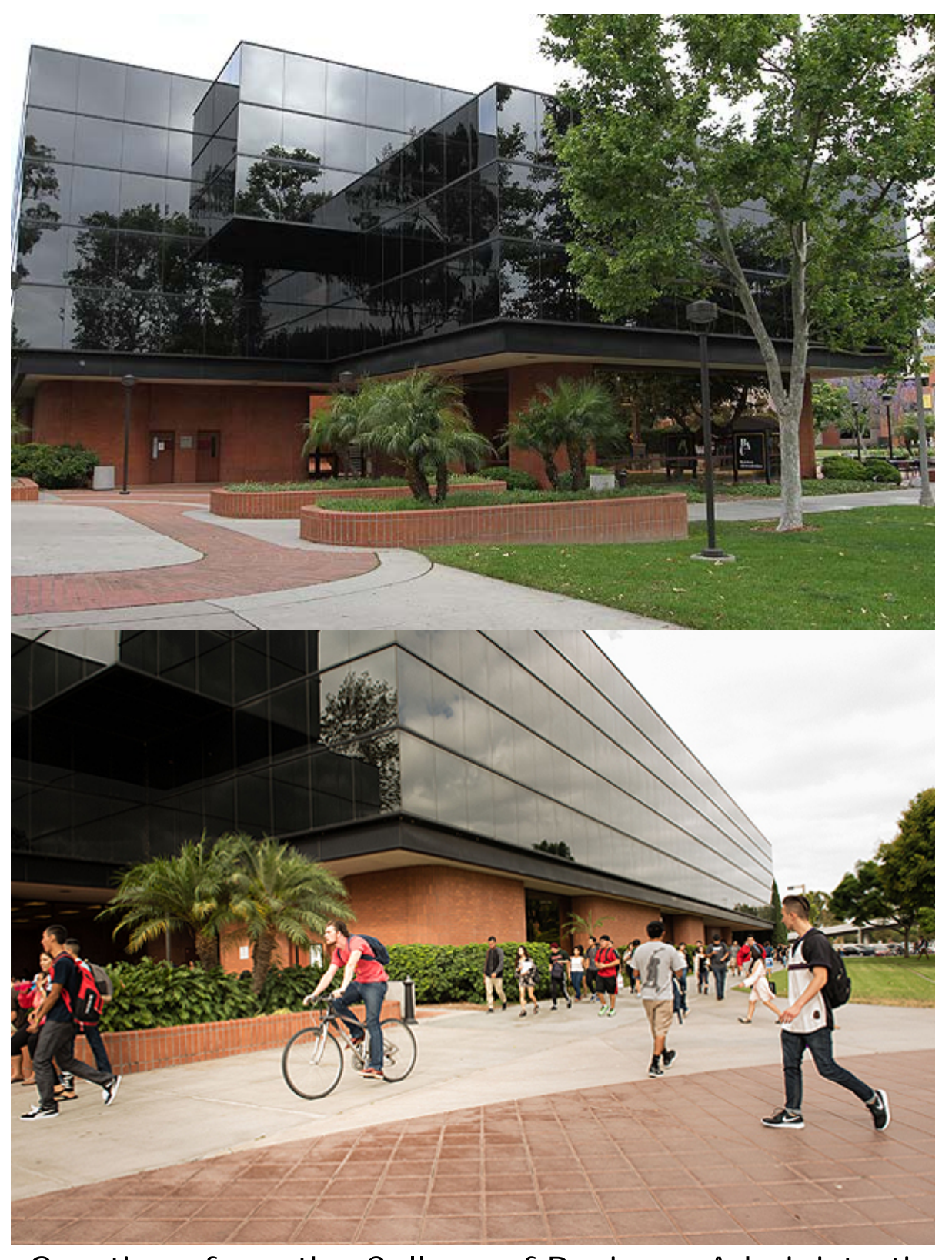
Greetings from the College of Business Administration