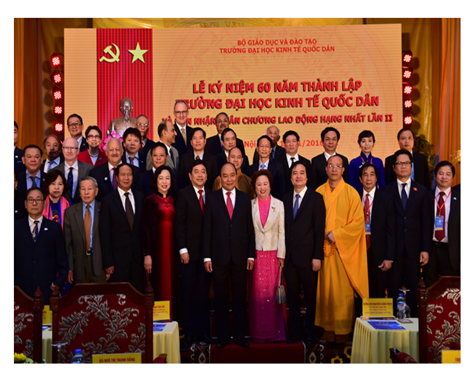
NEHU's 60th Anniversary Celebration

"2+2" program. In this program, NEUH students will take their first two years of study at NEUH before transferring to CSULB to complete their degrees in CBA.