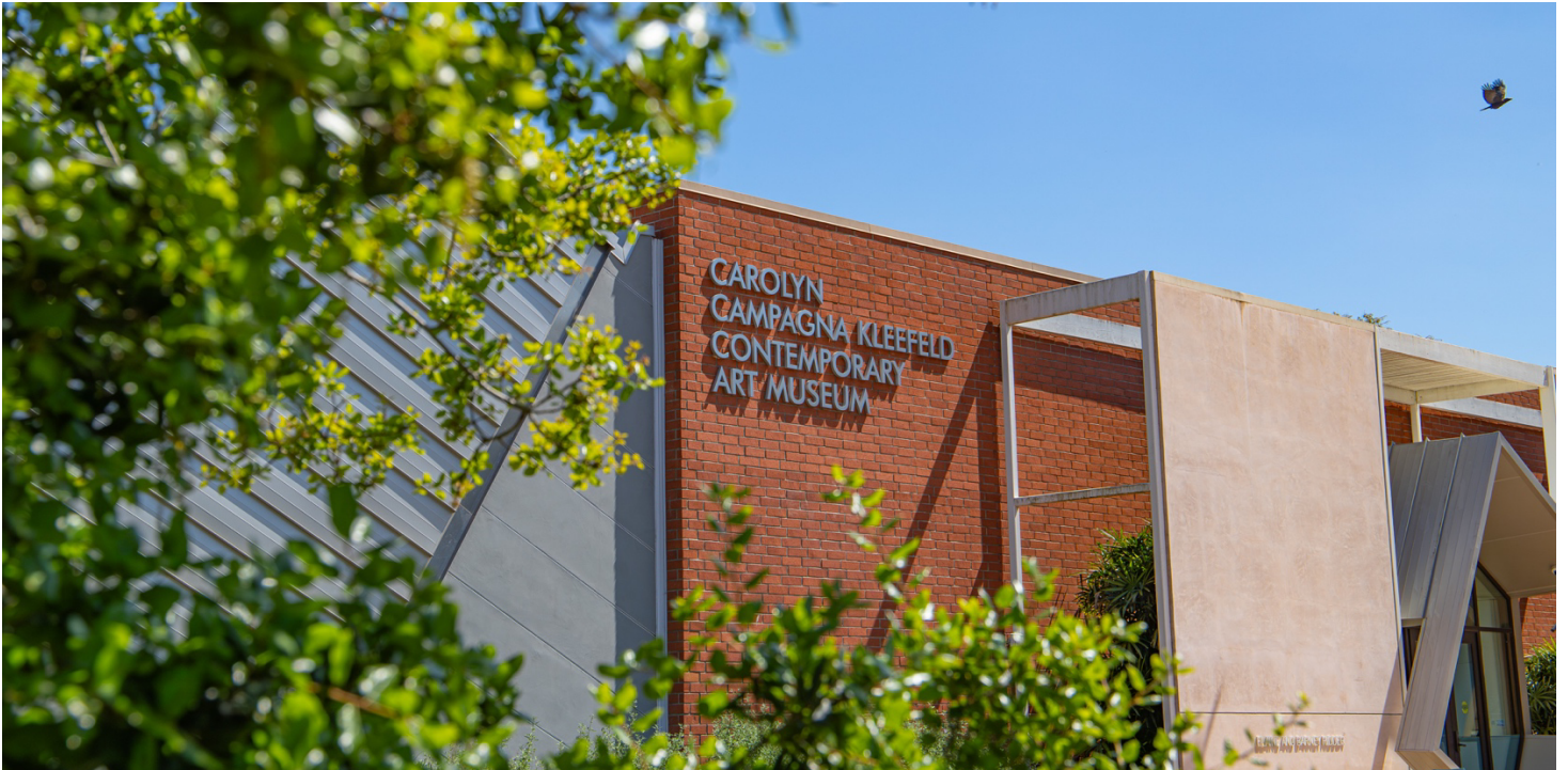
Photography of Carolyn Campagna Kleefeld Contemporary Art Museum, 2024.