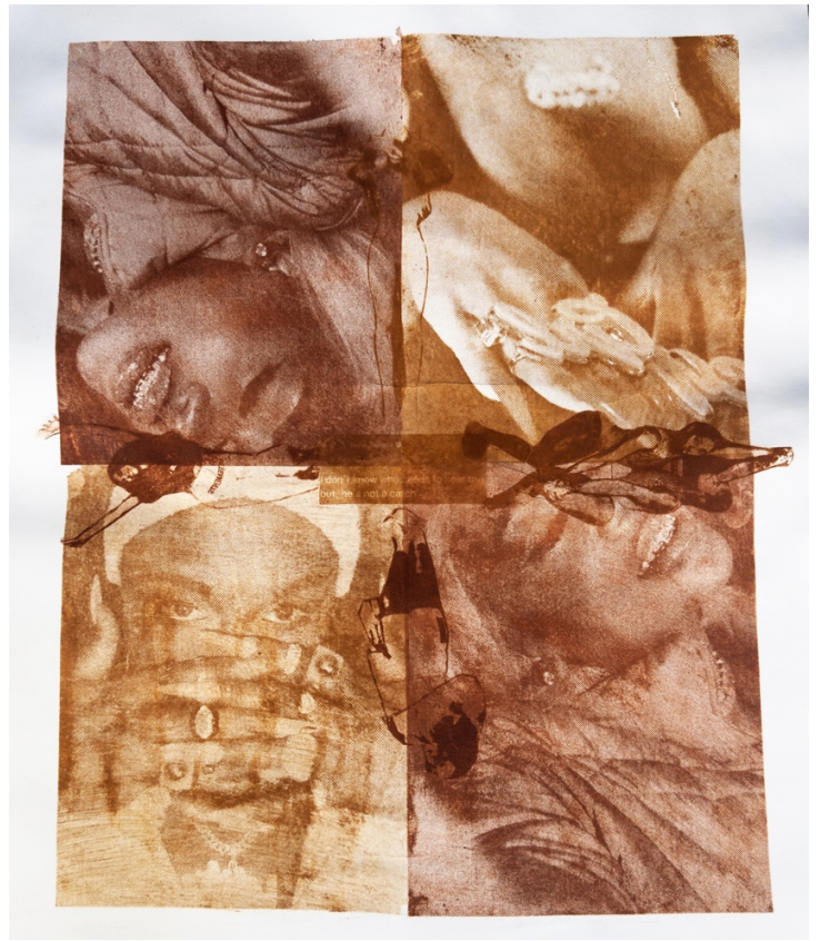
Jillian Thompson , she's in bloom , 2025. Stoneware and bronze. 26 x 1 inches. Courtesy of the artist © Jillian Thompson. Jillian Thompson , icy girl , 2025. Photo lithograph. 25 x 20 inches. Courtesy of the artist. © Jillian Thompson. Photos courtesy of Jillian Thompson.