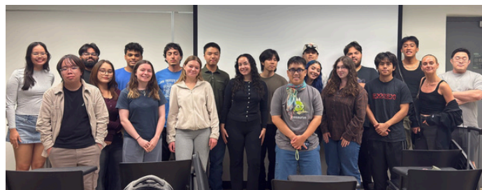
Spring 2025 ESA Board Members