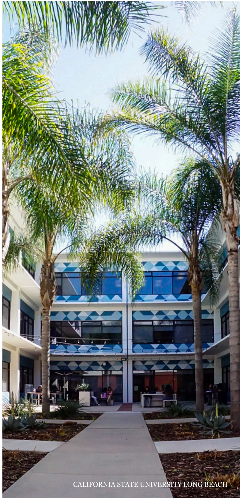
CALIFORNIA STATE UNIVERSITY LONG BEACH

Without further ado, here's what's new in the Department of Economics!