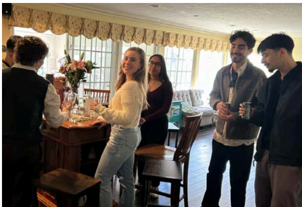
2025 Economics Department Holiday Party.