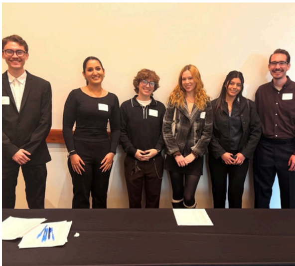
Economics Student Volunteers at CCIM.

We'd like to give a big thank you to the eight economics students who volunteered at the event. They had the chance to learn more about regional economic trends, connect with professionals, and attend a lunch with the keynote speaker and panel. It's always great to see our students getting involved and making the most of these experiences!