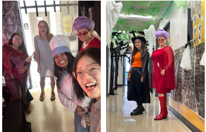
SSPA Department Staff Colleagues.

Staff Council Spooktacular Office Decorating Contest – The Economics Department staff proudly joined forces with the Political Science Department, the Master of Public Administration Department, and Social Work for the big department office decorating contest. Staff from all departments dressed as characters from Shrek 2 . We were proud of the collaborative effort put into bringing our theme to life with festive decorations and matching popcorn giveaways.