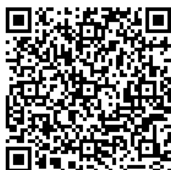
Resource Guide (Spanish)