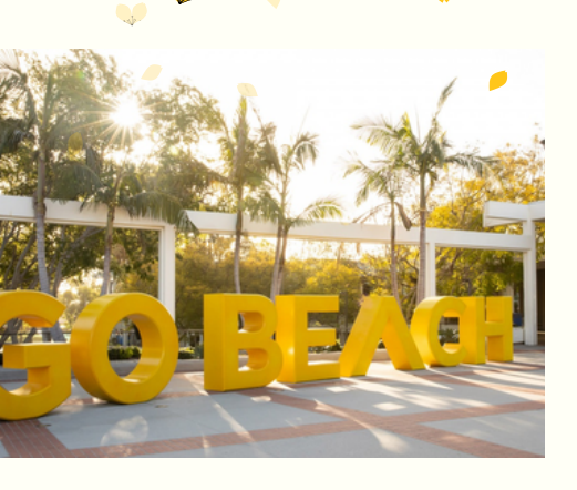
4/13/24 Day at the Beach University, wide day to welcome students to CSULB for the Fall 2024