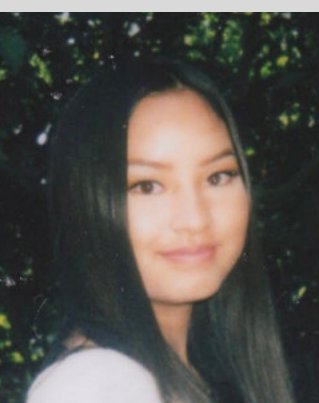
ASHLEY SET Community Health Education For the Child