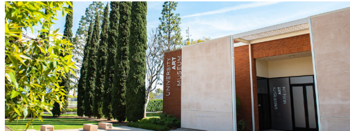
Kleefeld Contemporary Art Museum