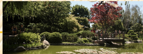
Earl Burns Miller Japanese Garden

The garden is inspired by the beauty of Japanese landscapes. The garden, koi pond and traditional teahouse are open to students and the public.