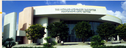
Carpenter Performing Art Center

This visually stunning performance venue offers a variety of performances in dance, film, music, theatre and more. The CPAC is part of the College of the Arts and provides students with opportunities to engage with professionals that perform here.