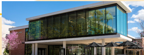
Student Success Center

The SSC houses services such as: Bob Murphy Access Center, Dream Success Center, The Learning Center, Education Opportunity Program, University Center for Undergraduate Advising and Women's & Gender Equity Center.