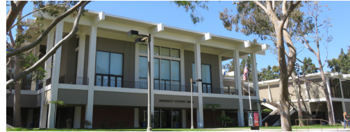
University Student Union

The USU offers dining options, event and recreational facilities such as bowling, swimming and video games as well as free movies and live music. The building also has study areas and meeting spaces for clubs and organizations.