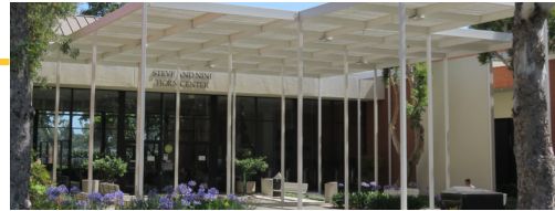
The Horn Center

The recently renovated Horn Center will feature an expansion to the adjacent Kleefeld Contemporary museum and will include the addition of new, state-of-the-art lecture halls, classrooms, student lounge and computer lab.