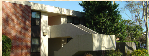
University Housing & Residential Life