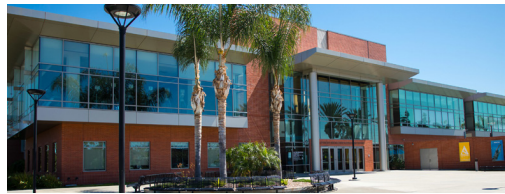
Student Recreation & Wellness Center