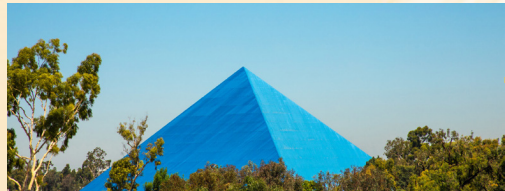
The Walter Pyramid