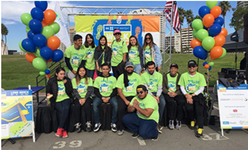
AMA students participating in the 2016 Be The Match Walk+Run on November 19