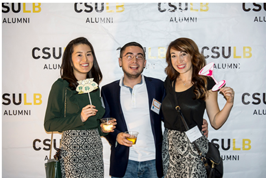
AMBA 9 alumni pose for a photo booth picture

On Saturday, November 12, CBA Graduate Programs welcomed over 100 alumni to its second annual alumni mixer. The CBA courtyard was lit up with music, lights, and lots of alumni and current graduate students representing all of CBA's graduate