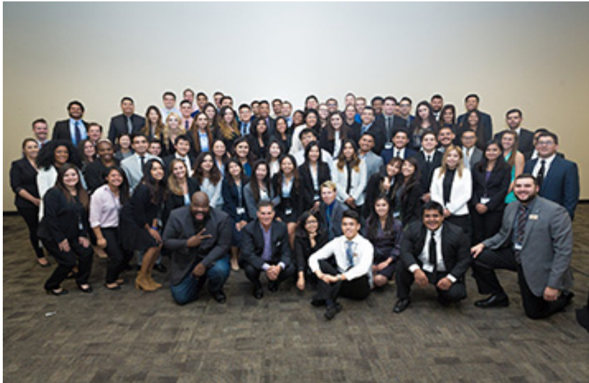
AMA students participate in the Annual AMA Western Regional Conference