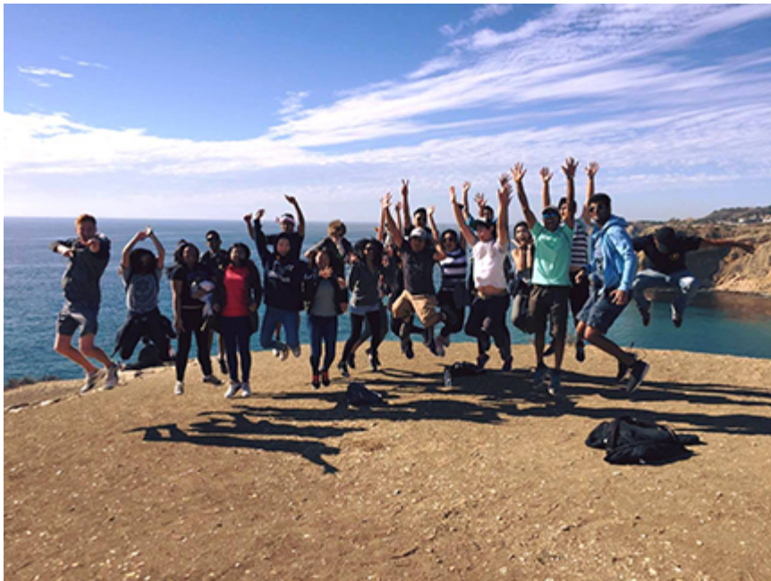
ISSA students participating in a hiking networking event