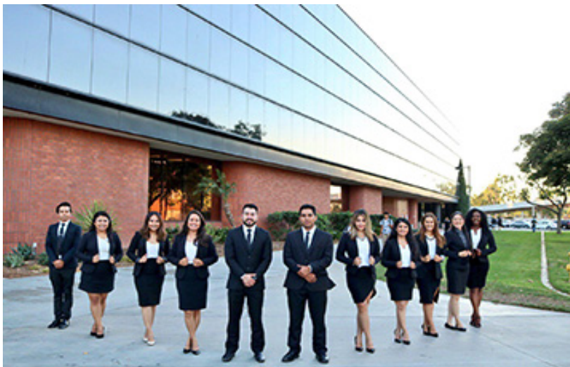
2016-2017 ABSOC Officers

This past semester, the American Marketing Association (AMA) focused on providing members with a mixture of experiences that provide professional and personal growth through the use of CBA's student-run marketing agency, professional speakers, workshops, and networking opportunities. These experiences complement the university's academic curriculum and enhance in class lessons by providing real life activities.