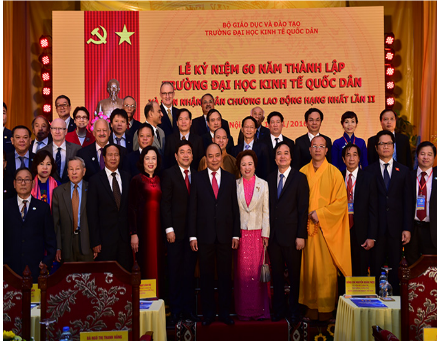
NEUH's 60th Anniversary Celebration

“2+2” program. In this program, NEUH students will take their first two years of study at NEUH before transferring to CSULB to complete their degrees in CBA.