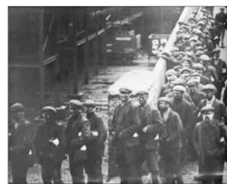
1000,000 workers were locked out during the 1926 General Strike.