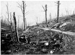
Fontaine Ravine, from the Battle of Verdun