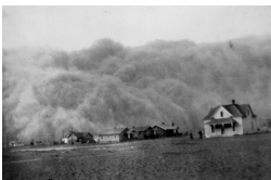
Dust storm approaching Stratford, Texas.