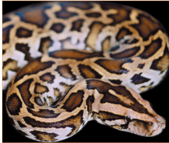
Hearty meal: the python's cardiac ventricles grow after feeding.

Burmese pythons are considered to be an excellent model of extreme physiological upregulation 3 . While digesting, their metabolic rate may increase by up to 40-fold relative to the fasting rate and may be raised for as long as 14 days (ref. 3). This increase in oxygen consumption is accompanied by rapid remodelling of many physiological systems: within two days of feeding, there is a substantial increase in wet mass of the gastrointestinal system, kidneys, liver, pancreas, lungs, heart and stomach 4 . However, the cause of this remodelling, which could be increased protein synthesis or increased fluid content, is unclear 3,5 .