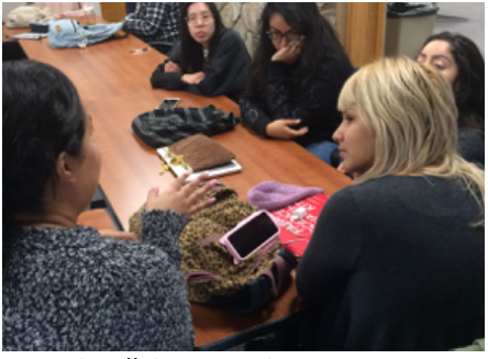
Top: Small Group Brainstorm Bottom: Hands-on activity with aging simulation suits