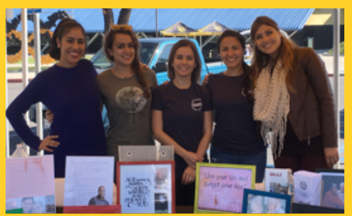
November, 2016: CSULB Homecoming, Long Beach, CA