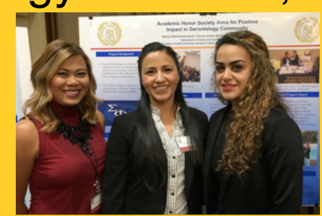
GAPHS members presenting the CSULB Gerontology Academic Society at CCGG Annual Meeting, Sacramento, CA

"You are never too old to set another goal or to dream a new dream..."