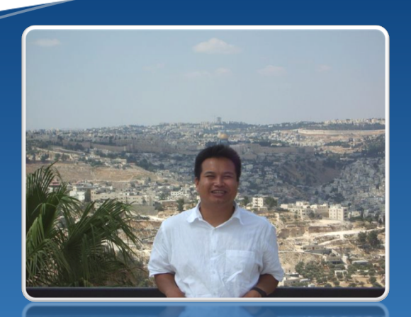
"Don't let the long last name frighten you. Try to pronounce it like CHEWN-LA-MOON-TREE. That was simple, right?"

At Los Angeles Mission College, he has designed and implemented a mentorship program for 120 Teacher Prep Students and over 50 Mentors to advocate for student services and plan for student success at the college level and beyond.