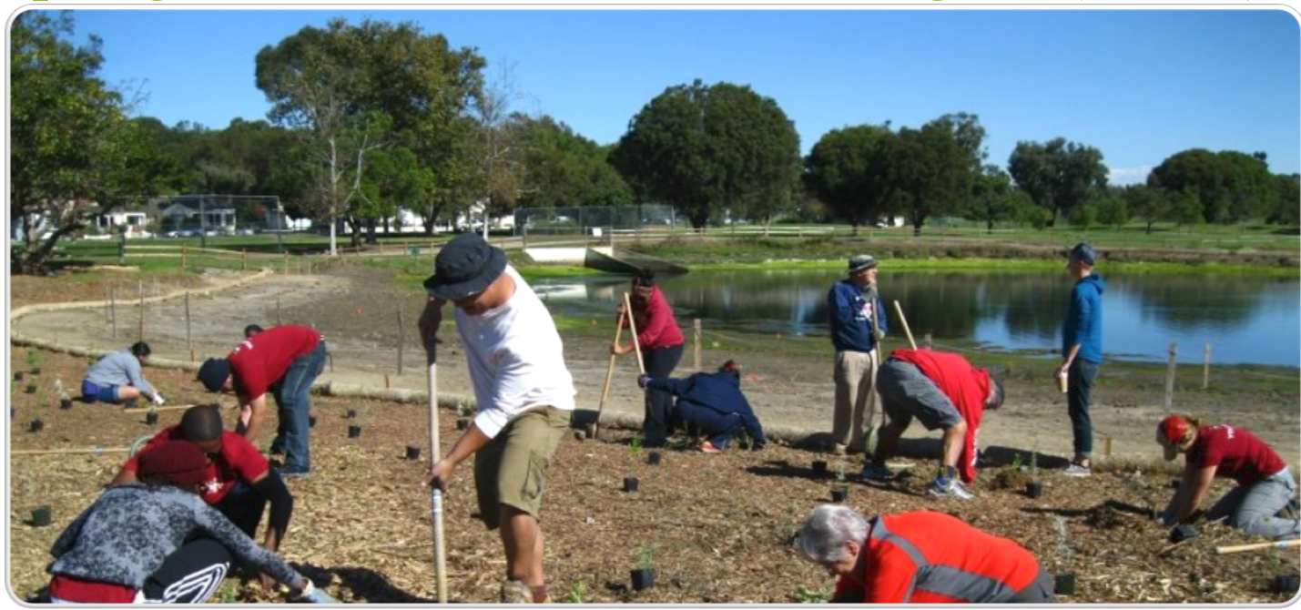
Tidal Influence. "Volunteers helped plant 215 plants on November 5th, 315 plants on the November 10th, 420 plants on November 12th, 150 on November 19th, and the salt marsh is looking happy and healthy."

What was once a sandy swimming beach and home to the 1932 United States Olympic diving and swimming trials, the Colorado Lagoon deteriorated over time into a highly polluted lagoon covered in benthic algae. If not for the local efforts of concerned citizens, this neighborhood wetland could have been lost to the community forever due to poor water quality and high sediment toxicity.