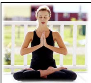
Taking time to relax can energize the mind and help the body fight illness.