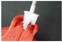
This picture shows a “broom” being used to collect a sample from a cervix model.