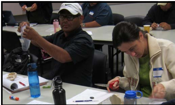
2011 workshop participants working on an art project .