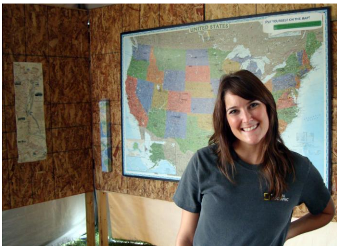
Working at the NG tent, the Boy Scout Jamboree Fort AP Hill

We are currently conducting a sock drive for the homeless with a goal of collecting 1,000 pairs of socks. We are planning events including a beach cleanup, in lieu of Geography Awareness Week's overarching theme of clean water. We are also offering students a chance to showcase their class presentations during club meetings to prepare for class presentations. Fundraising for student scholarships is ongoing as we sell our GSA t-shirts and collect donations. Spring semester will resemble that of 2010 as it was a great series of events and opportunities for our members. We will continue to grow and help our fellow students to become leaders.