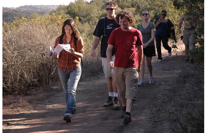
Day hike at Laguna Coast Wilderness Park

SR: In the Geography Education National Implementation Project I wrote a report on the status of U.S. geography education and helped with numerous other projects such as the preparation of outreach strategies for Geography Awareness Week.