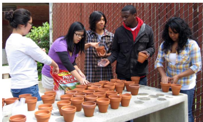
The infamous "mustard mulch" potted plant experiments

Students worked full-time on these projects for six weeks in the summer, doing real research both in the field and in the Geography/Geological Science labs and then presenting their work at a public symposium on campus (and some of them have taken their projects to professional conferences, too!).