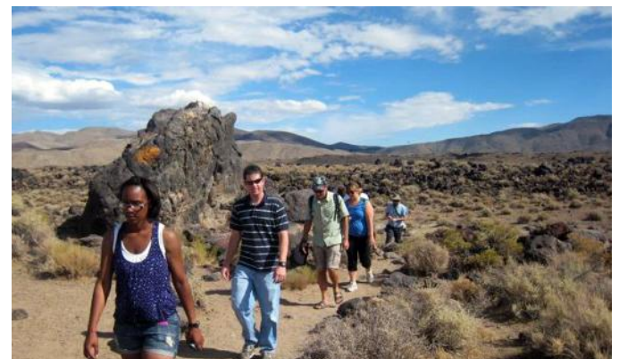
Trekking to Fossil Falls for lunch by an ancient stream

In October 2010, the class of Geography 486/586: Landscape Analysis headed east on Highway 14 to the Eastern Sierra. This year's class is a combination of physical landscape analysis method and qualitative human geography techniques. On this fieldtrip, students learned how to measure plots in the Mojave in order to do vegetation sampling, visited the ancient site of Fossil Falls, and explored a glacial lake near Mammoth Lakes. Students also visited the authentic (or is it???) ghost town of Bodie, California . Once a busy gold rush town, only a small selection of the buildings remains, preserved in an intentional state of "arrested decay". Students practiced their participant observation, video-touring and interview techniques in the striking surroundings of Bodie State Historic Park. How do you respond to ghost town landscapes? These students investigated the cultural geography of Bodie with particular attention to how the concept of authenticity is conveyed through place.