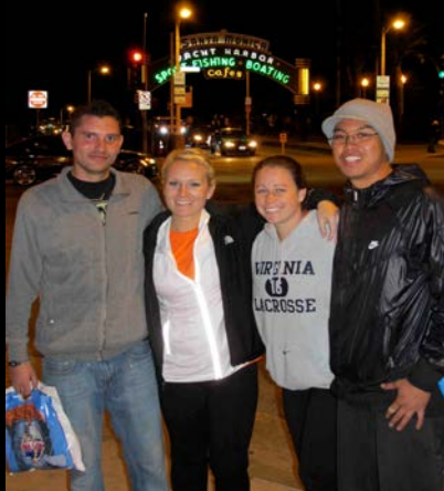
Members of LT 18 at the Santa Monica Pier