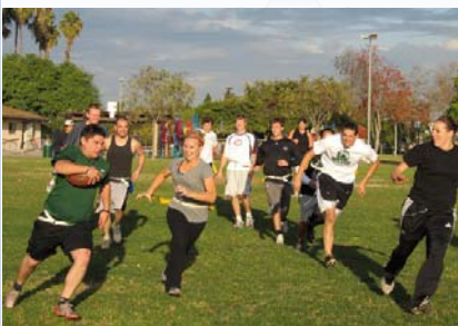
Left, Learning Team 18 faces Learning Team 17 at the Turkey Bowl Flag Football Tournament. Right, Learning Team 18 visits Qualcomm Stadium for a Chargers game.