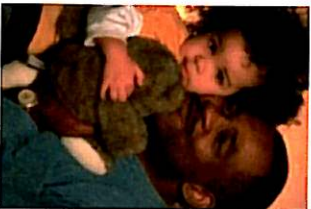
Helping children and families...