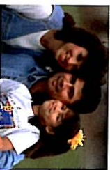
Getting well prepared for a career in Public Child Welfare!

Priority is given to current county and state Department of Social Services employees and applicants who reflect the diverse client populations currently served by child welfare agencies in California. Current employees must be on educational leave during the academic year.