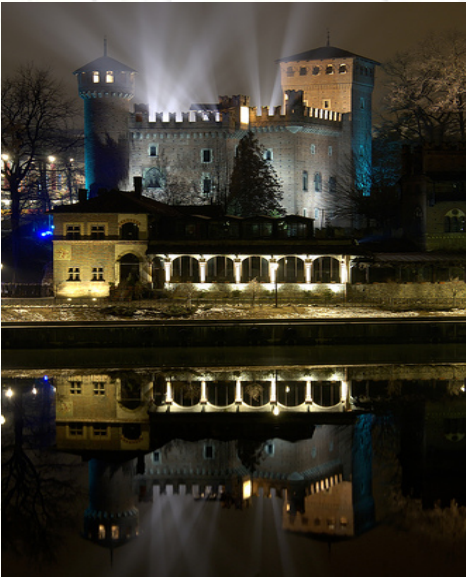
CASTELLO DEL VALENTINO PICTURED ABOVE