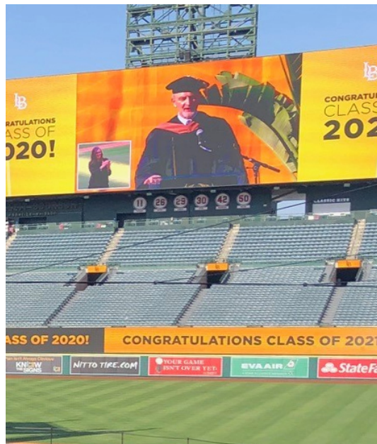
Commencement – Celebrating the Classes of 2020 & 2021