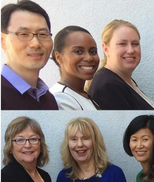
Ukleja Center for Ethical Leadership: 2021 Faculty Stipend Recipients Announced