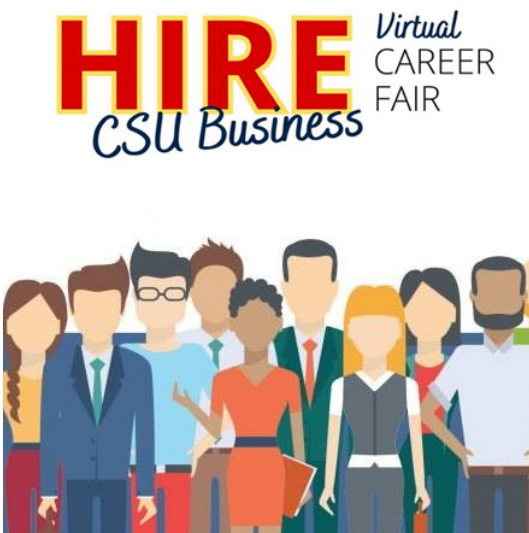
Hire CSU Business Fair